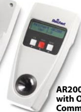
AR200/TS METER-D with Optional Communications Cradle