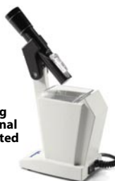
Goldberg w/Optional Illuminated Stand