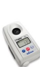
r 2 mini